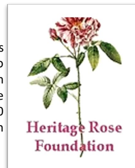
Newest WFRS Associate Member

The application I presented on behalf of the Heritage Rose Foundation was fully approved; please join me in welcoming them to our fold. I have also submitted an application for the beautiful rose garden at the Huntington Botanical Gardens in California; that application is pending approval. The Huntington contains approximately 2500 rose bushes of about 1300 cultivars and is impeccably maintained. I anticipate being able to bring in additional Associate Members over the coming months.