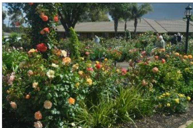
Trimper Rose Garden 2022