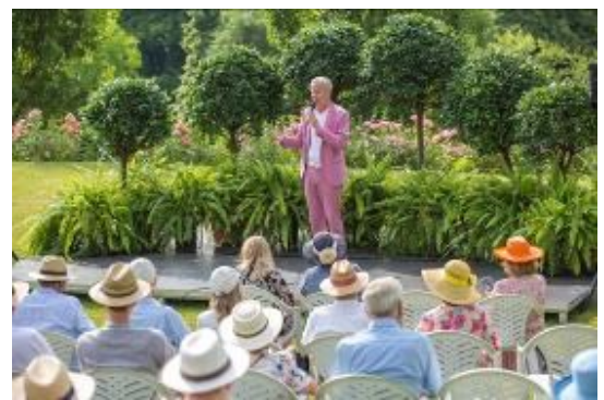
Left: Manhattan Rose Society Holiday Party, Middle: Saverne, France, Right: Baden-Baden Mayor welcoming Judges

2027 WFRS Regional Convention: I have been lobbying a number of U.S. cities to host either a World Rose Convention or a WFRS Regional Convention. Any announcement at this time is premature. However, things are looking good for a WFRS Convention or Conference in the USA in the Spring of 2027.