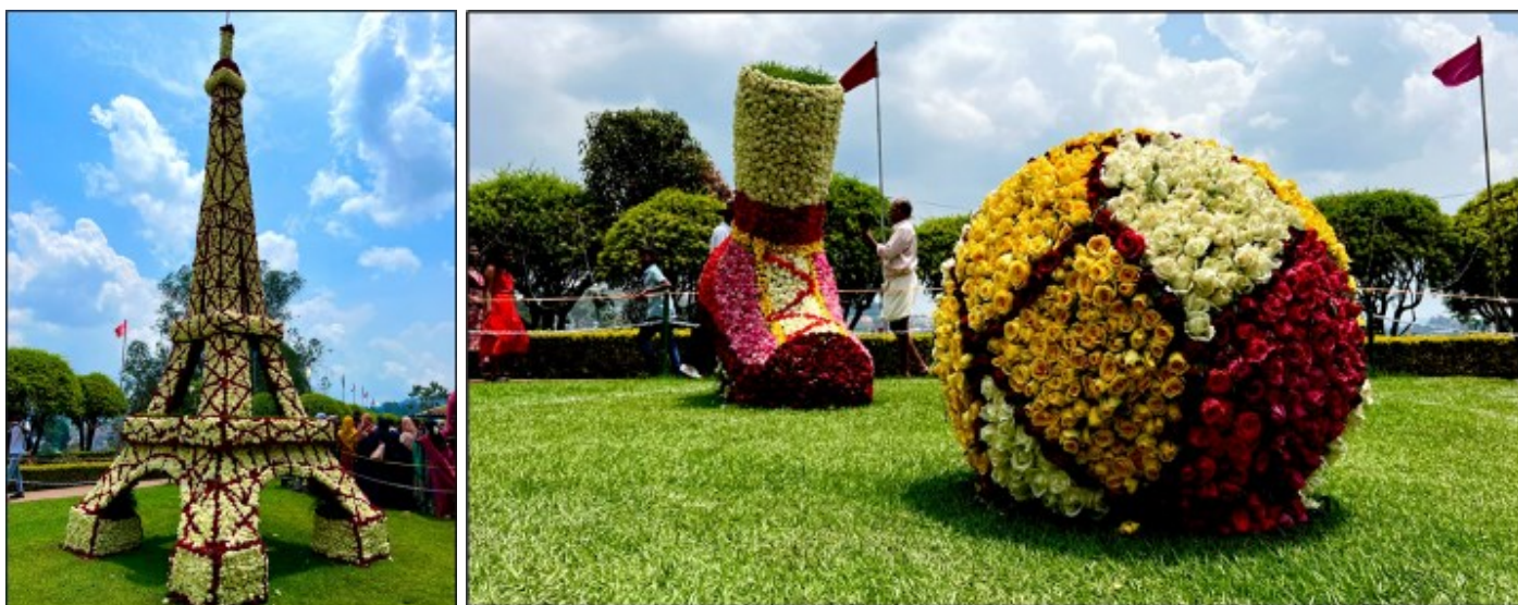
Ooty Rose Garden

The 18 th rose show was inaugurated by Honorable Tourism Minister K. Ramachandran and Honorable Hand-loom and Textile Minister R. Gandhi in the presence of District Collector S. P. Amrith I.A.S.