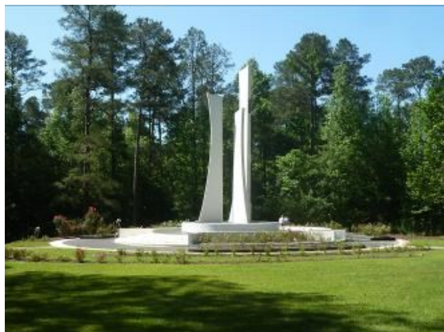
American Rose Society International Rose Trials