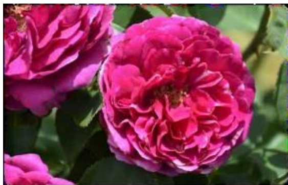
Adelaide Australia 2023 Gold Medal Winner, 'Fur Elise' (Kordes)

We hope that weather and climate conditions will improve and that we will be able to meet again at the next edition in May 2025.