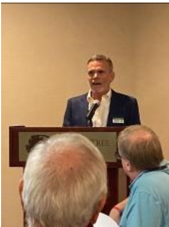
Author lecturing at New York District Convention

2023 American Rose Society New York District Convention: I was the keynote speaker at the Awards Banquet and my topic was "An Introduction to the World Federation of Rose Societies." I ended with a brief game "Name that World's Favorite Rose." I gave some clues about various cultivars elected to the WFRS Hall of Fame, and the person with the most correct answers won a copy of the book WFRS 50 Golden Years .