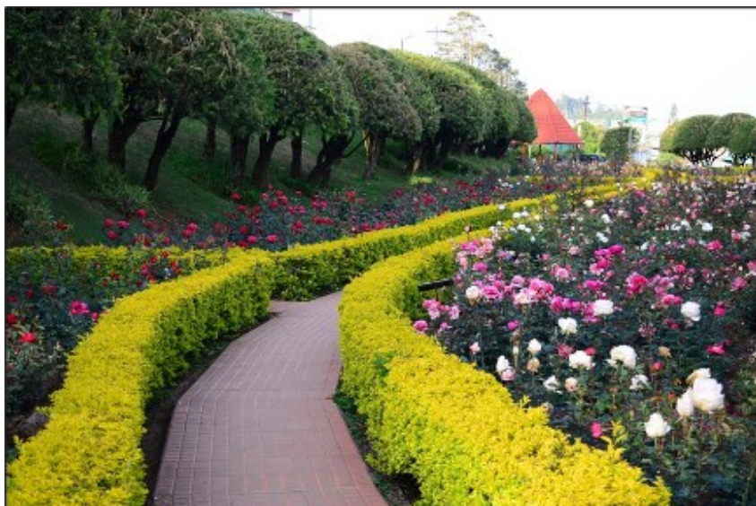
Ooty Rose Garden

This year the 43rd All India Rose Show was held on 12th, 13th & 14th of January 2024 at Government Rose Garden Bhopal. This was organised by MP Rose Society in collaboration with the Horticulture Department of Madhya Pradesh.