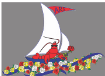
Sailing On a Sea of Roses, ARS National Convention

After promoting World Rose News for about a year, I am now directing my efforts to promoting our publication By Any Other Name . Both are available via a link on the American Rose Society website, and the Canadian Rose Society frequently publishes links to these publications in their newsletter. I continue to work with the WFRS Publications committee to provide content for both our Instagram and Facebook accounts. I was recently bestowed the designation of a "Top Contributor" to the WFRS Facebook page. My suggestion to establish a WFRS "Member Country Calendar of Events" in World Rose News was implemented; my first submission was the American Rose Society's National Convention which will take place in September 2024.