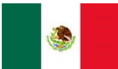
Mexico is poised to be our newest member

I have contacted a number of key individuals in Mexico to facilitate the establishment of a national rose society in their country. My outreach was well received and I anticipate the Mexican Rose Society to be launched later this year.