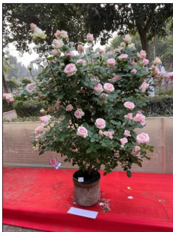
Below: Bengal Rose Society Pot Culture