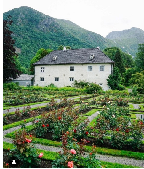
Baroniet Rosendal Rose Garden

Education and Research: Gothenburg Botanical Garden plays a pivotal role in horticultural education and research. It serves as a hub for botanical studies and research projects. Visitors have the opportunity to learn about plant conservation efforts and gain a deeper understanding of the natural world through educational