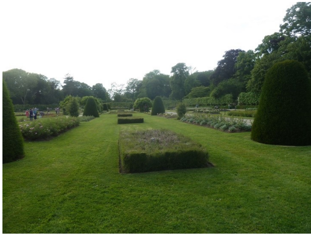
Vrijbroek Park, Belgium

Note: for website information on the above Associate Members, please go to the WFRS website.