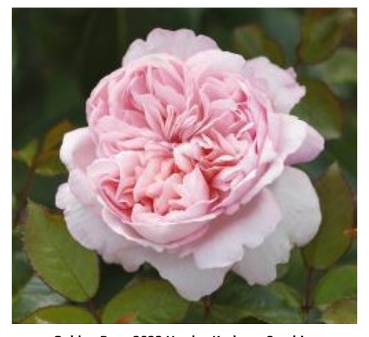
Golden Rose 2023 Hradec Kralova, Czechia 'Mauritia 'by Tantau, Germany