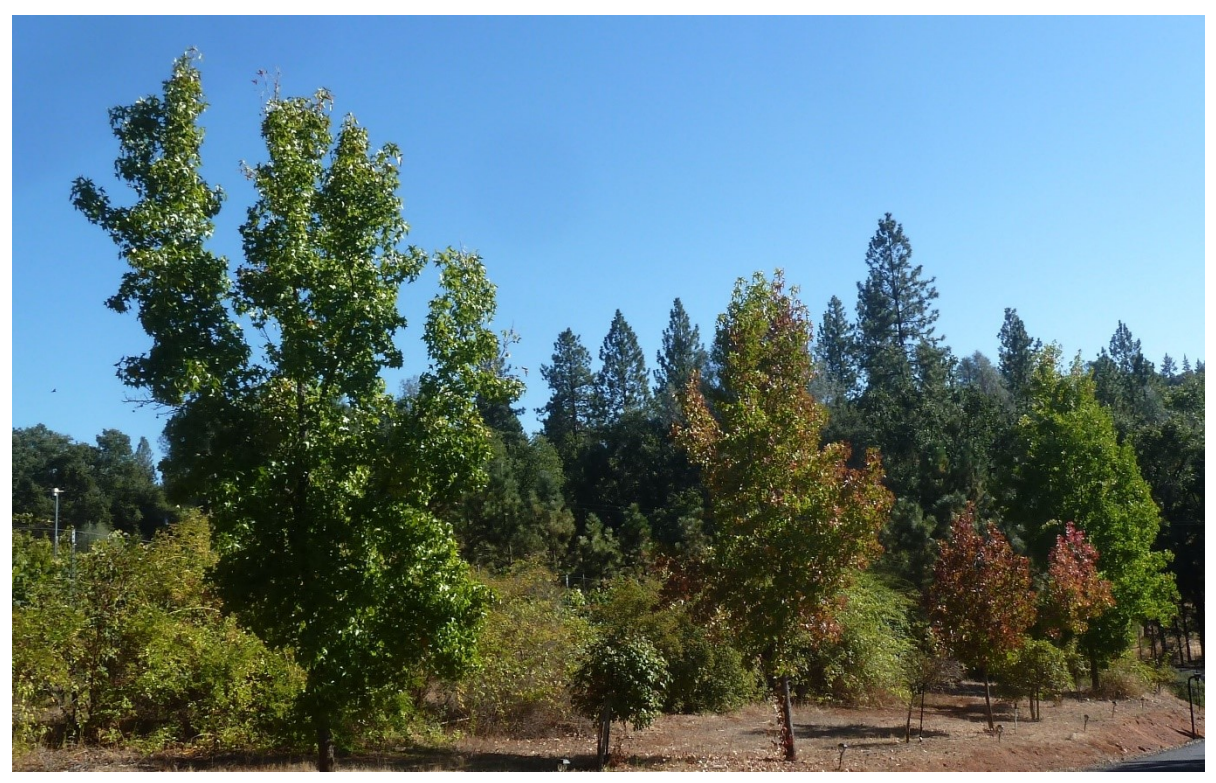
It's Fall Y'All!