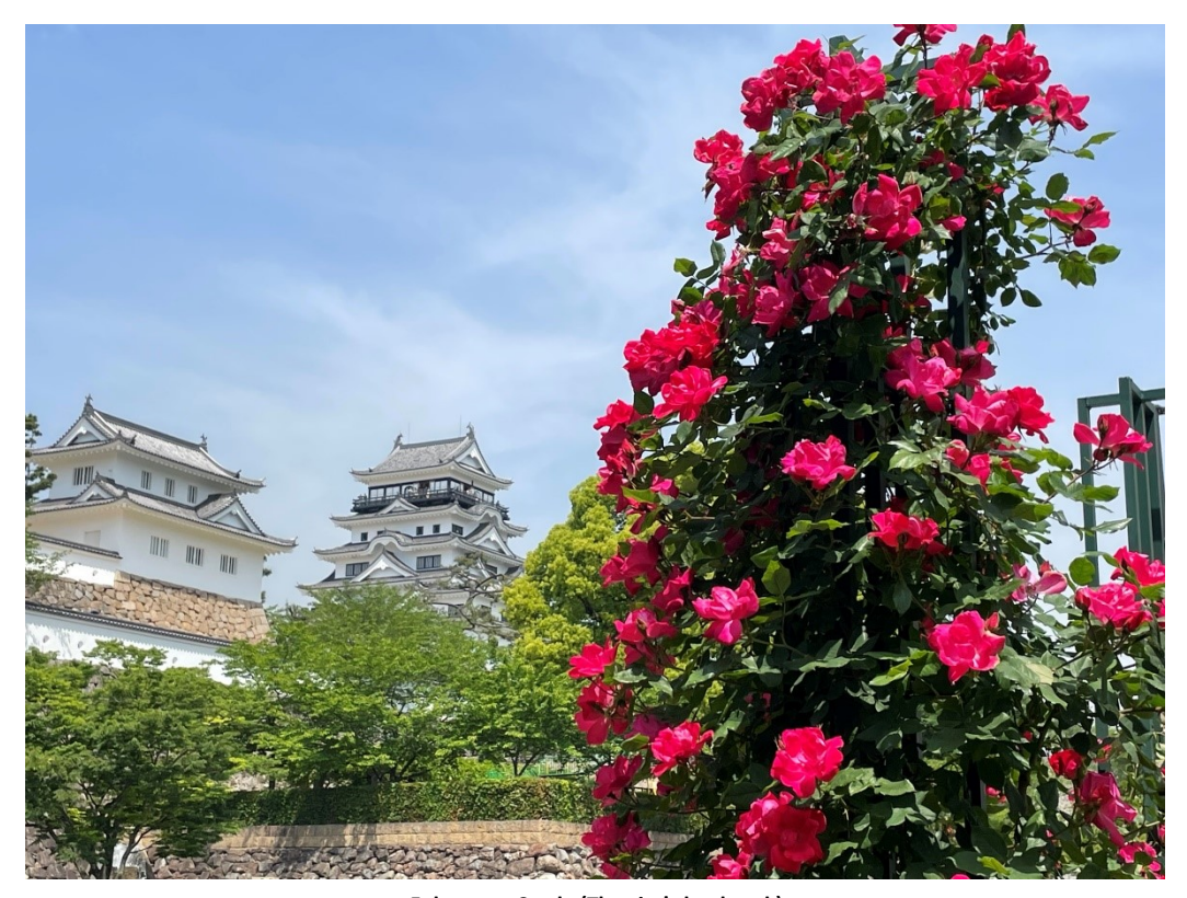
Fukuyama Castle (The city's landmark)