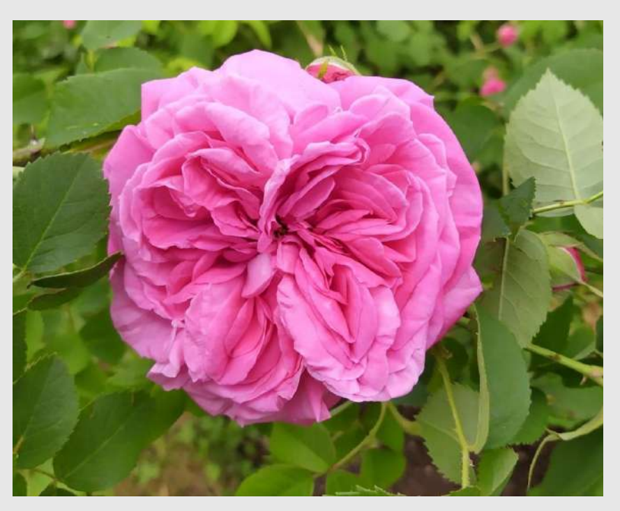
´Aurelia Liffa´ - Geschwind – before 1885

He tried to achieve this by crossing the varieties of the time with botanical rose species. He also devoted himself to breeding the then new groups of modern roses. An example is the tea-hybrid 'Astra'. The result of his efforts was 135 rose varieties, of which 41 varieties are grown in the Olomouc rosarium