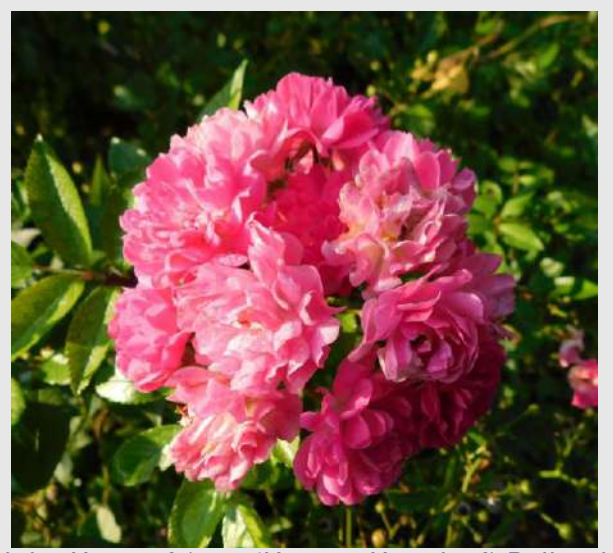
'Kaplnka Korona' (syn. 'Korona Kapolna') Poliantha. 2,5-3 cm pink, globular flowers, mild fragrance

'Baba Kay' is named after a rock in the Danube, between Serbia and Romania. 'Kaplnka Korona' after a chapel build close to the place where Lajos Kossuth buried the Hungarian royal crown, after the revolution in 1848. The chapel was built by Franz Joseph. When the area was submerged under waters when the Iron Gates hydroelectric plant was built,