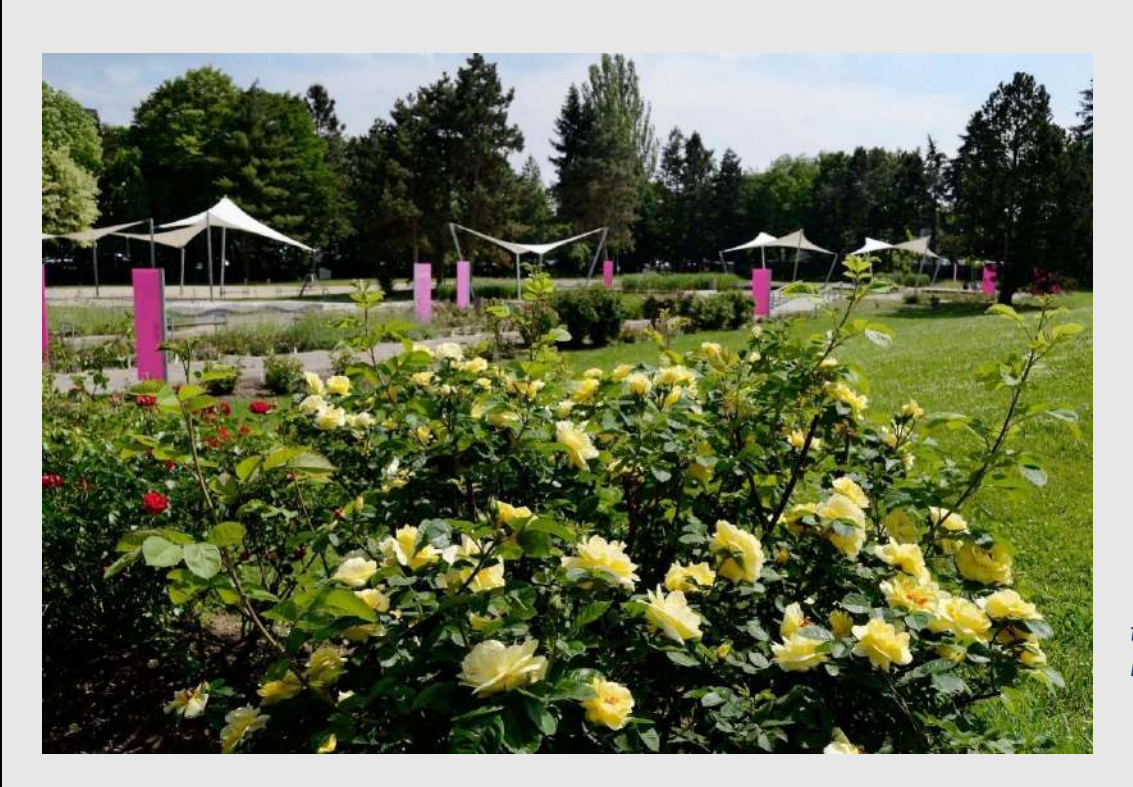
the rosarium in 2020

Modern rose varieties are divided according to the horticultural division into shrub roses, bedding roses and climbing roses. Garden roses are further divided according to the origin of the breeder. In the rosarium we have roses from breeders from the USA, Canada, Great Britain, Germany, France, the Netherlands, Denmark, as well as Ukraine. A separate collection is dedicated to roses bred in the Czech and Slovak Republics.