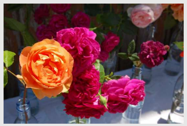
voting for the Rose of the Year

Stano Petráš tells the story of her house built in the park according to her plans which she called "Schweizerhouse" evoking old village house from some Swiss region. It had everything a traditional farm needed – poultry and a well, but also a collection of folk furniture and house items.