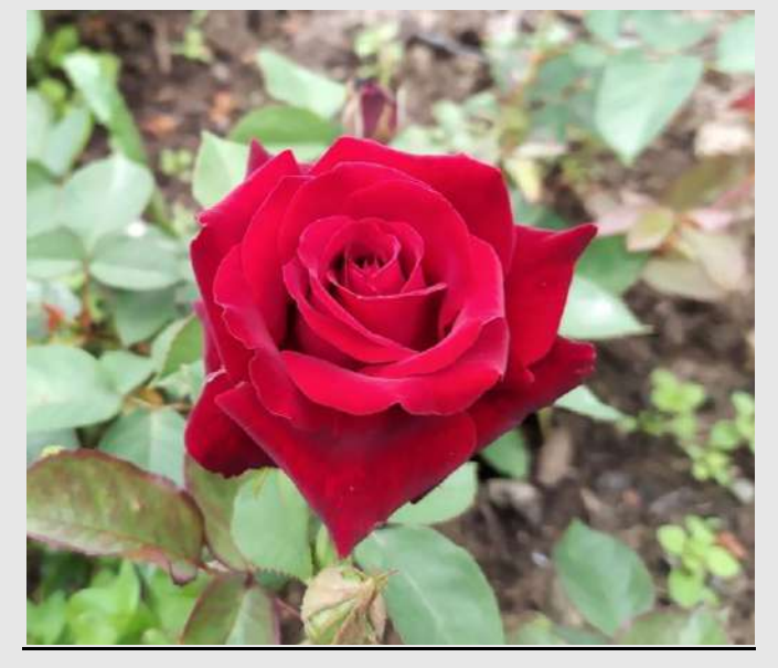
´Dagmar´ - Urban – 1988

Josef Urban (1928-2003) began to breed roses in ornamental and fruit nurseries in Želešice u Brna, where he established a separate section focused on rose propagation.