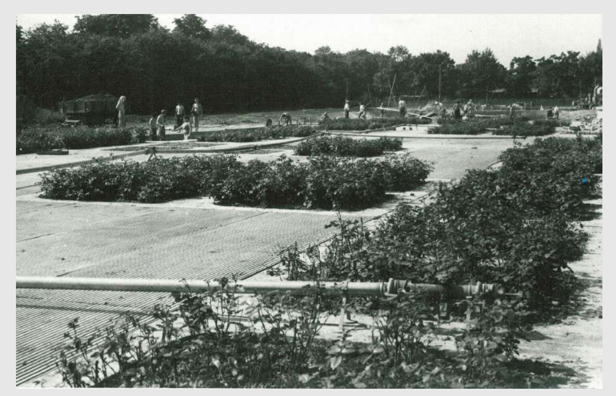
the rosarium at the beginning of summer, 1972

are connected by a smaller basin with a then fifteenmetre fountain. The individual blocks are made up of massive concrete frames on which concrete panels were placed to form the walking part of the blocks. The rose beds themselves are formed by concrete frames, and come in two sizes.