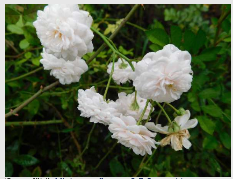
'Szeretföld', Miniature, flowers 2,5-3cm, white turning to pink, yellow at the base, mild fragrance.