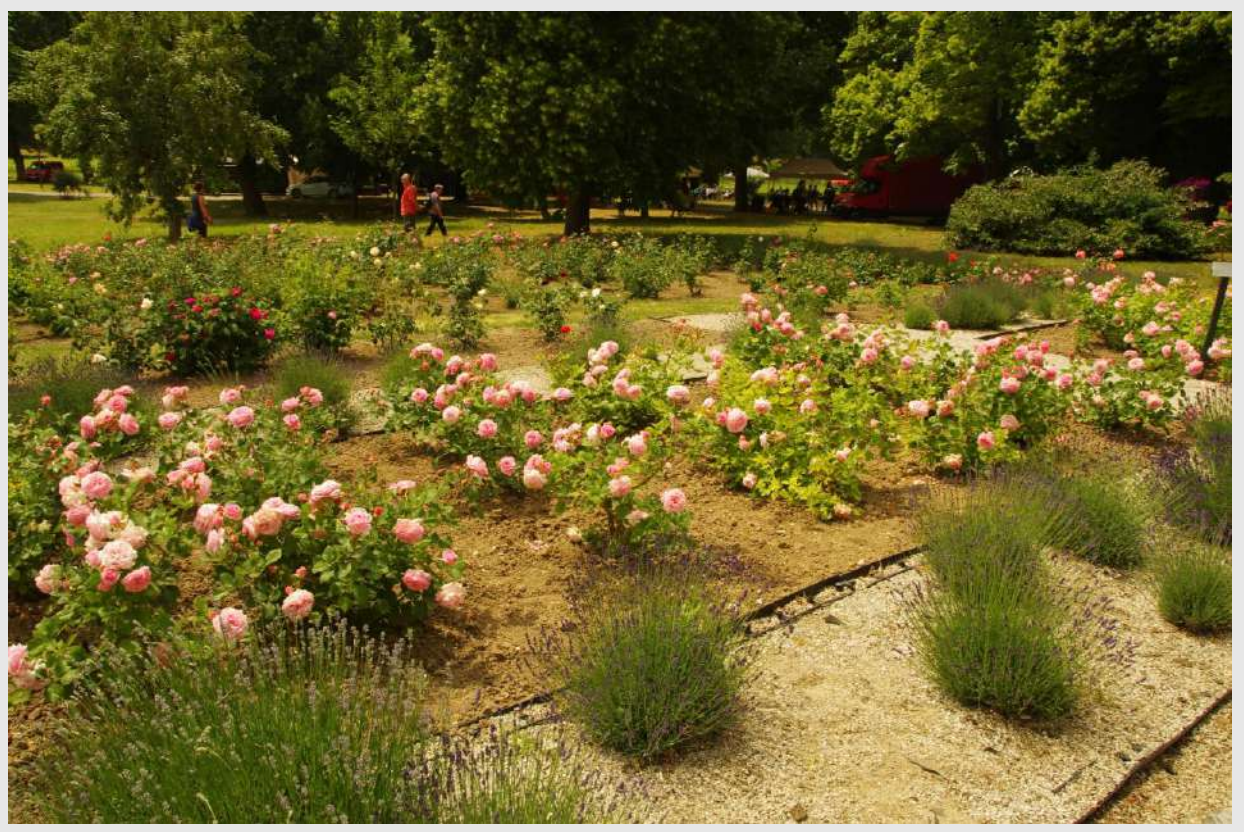
Rose beds in the park of manor house

Last summer during Rose Festival the new rose beds in park were celebrated. A collection of roses bred in a former Czechoslovakia including the seedlings of a contemporary breeder of miniature roses Szilvester Györi that were transplanted here from his garden, now a bit neglected, in exactly the same manner as Geschwind seedlings were transplanted here a hundred years ago.