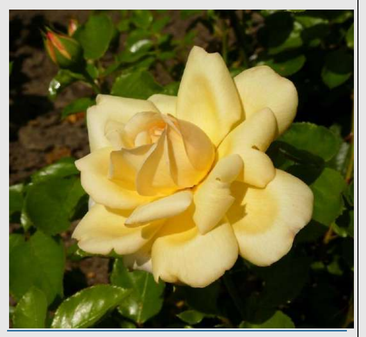
Zlaté Jubileum - Böhm – 1938