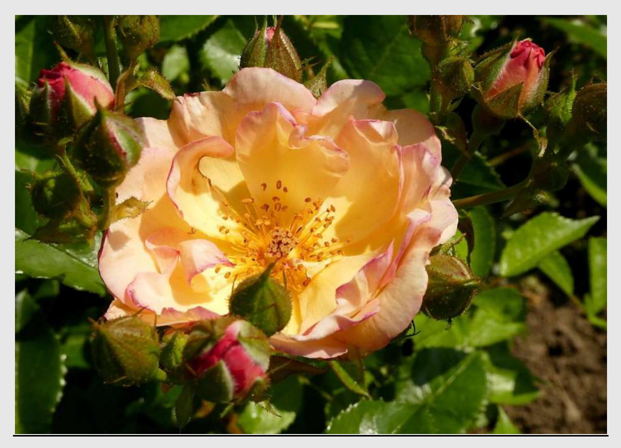
<sup>^</sup>Kalevala<sup>^</sup> - Györy – 2007