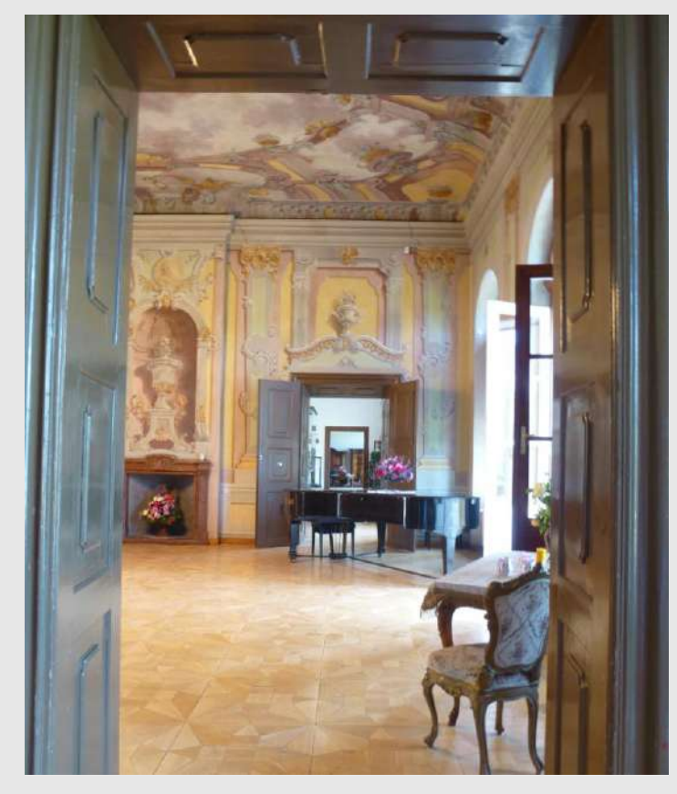
Flower arrangements in manor house during Rose Festival

But this year the Rose Festival will last just one day as the neoclassical manor house whose history goes back to the second half of 18<sup>th</sup> century is under a major reconstruction and is temporarily closed and will only be re-opened at the end of the year.