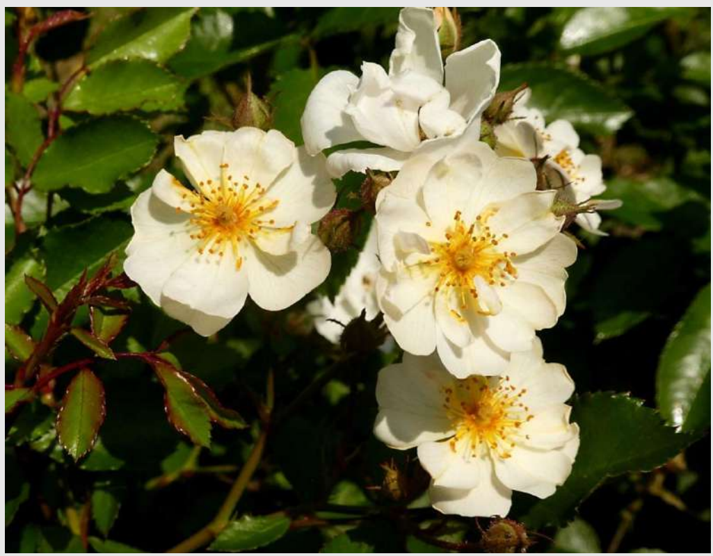
'Zsilinszky István' - Györy – 2008

The area of the Rosarium with the adjacent botanical garden is situated in the centre of Olomouc and creates a green oasis in the city. There is a children's playground, two public grills for rent, a refreshment stand and an information centre.