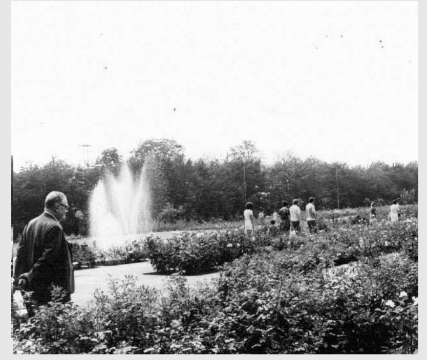
the finished rosarium, 1972

It was planned to continuously supplement and renew the assortment of roses with quality varieties, i.e. time-tested cultivars. At the opening ceremony, 180 rose varieties were on display, comprising 8,500 rose bushes. In 1975, there were already 385 varieties in 15,000 rose bushes. In the following years, the number of cultivars and shrubs was more or less maintained at the same level.