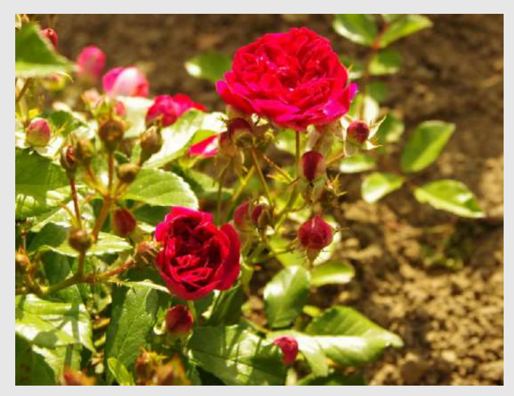
'Crumba' (Győry, 2010) old Latin name of Dolna Krupa, (Seedling x 'Swany') x (Seedling x 'Super Excelsa'), miniature ground cover rose