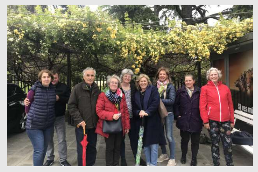
a group of rosarians in front of Rosa banksiae lutea, in Portoroz, Slovenia, April 2021