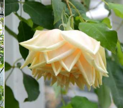
'Marechal Niel' in the botanical Garden, Warsaw