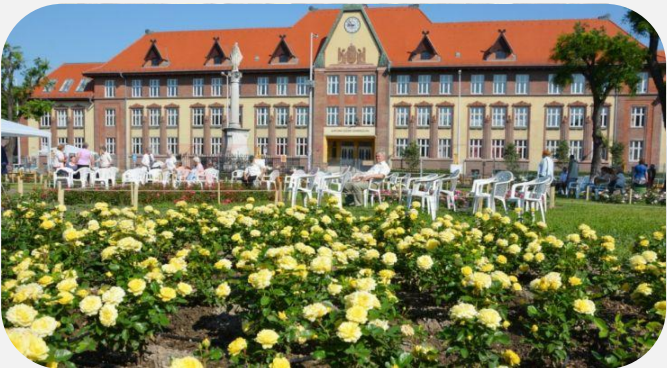
Rosarium A Boldogasszony Rózsakert, Kecskemet, Hungary

With the society's help and expertise a Rosarium was created in Kecskemet, and there are plans to renew the garden.