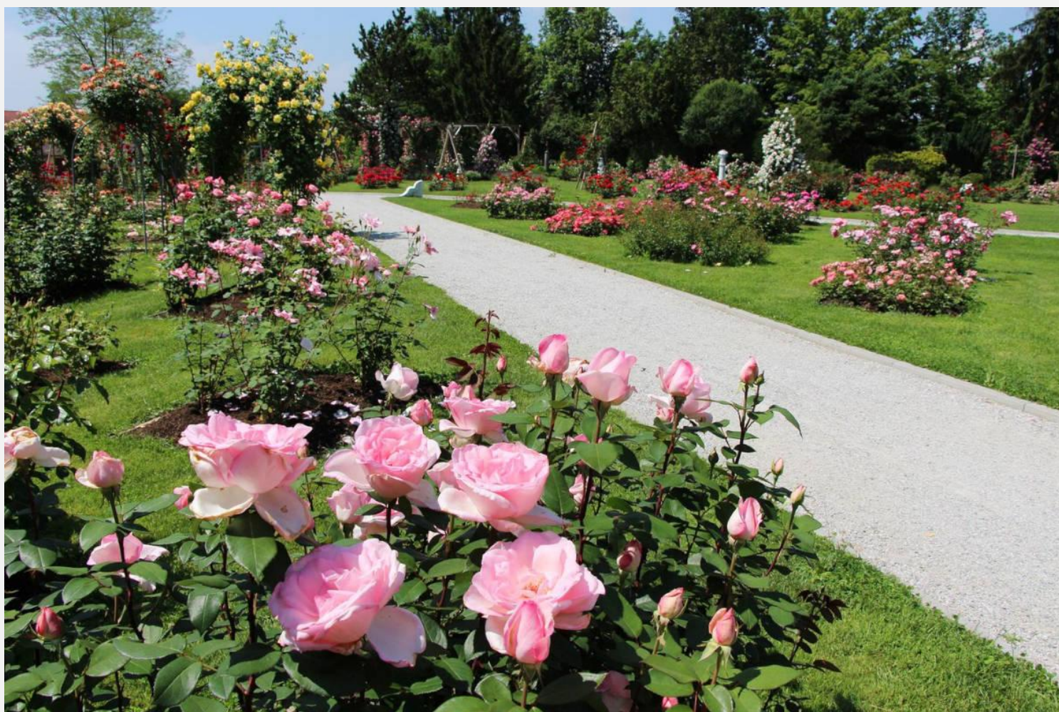
Rosarium in Arboretum Volcji Potok, Slovenia [WFRS Award of Garden Excellence, 2022]