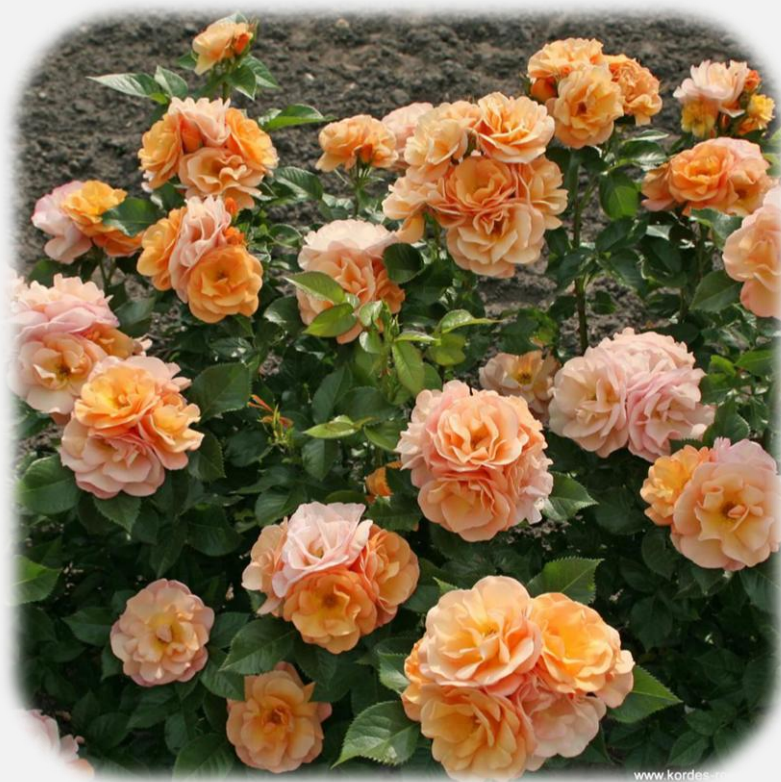
‘Portoroz’ [Kordes, 2000]