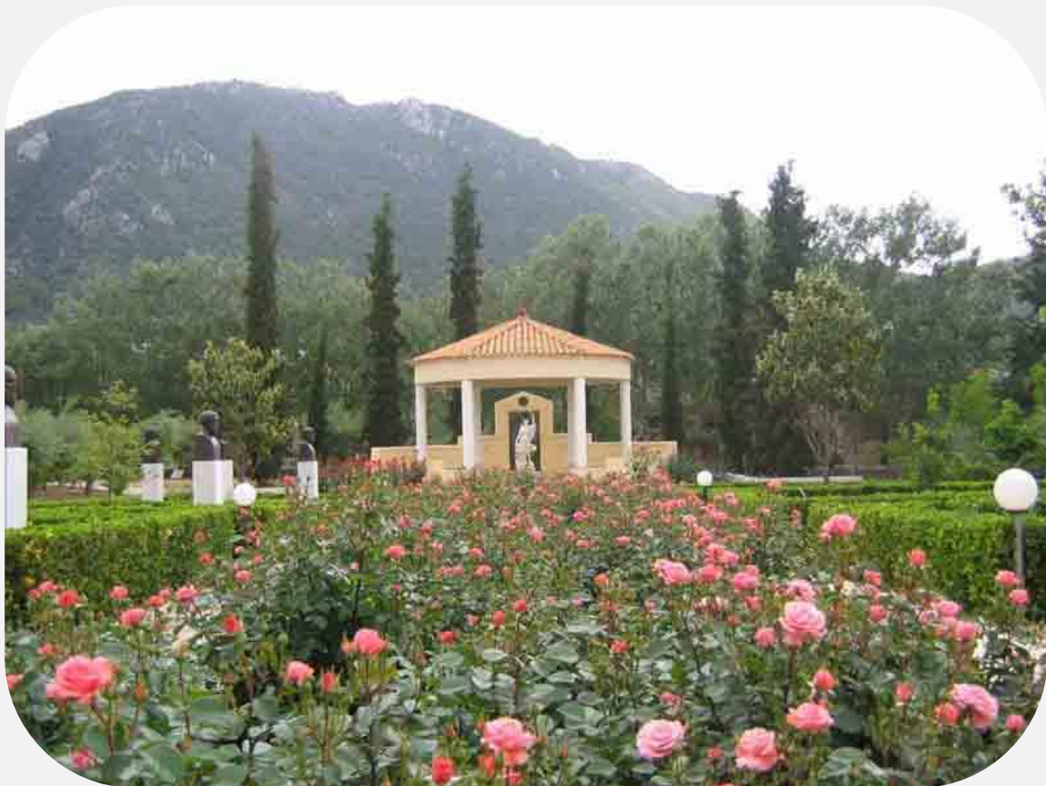
Historic Rose Garden, Greece