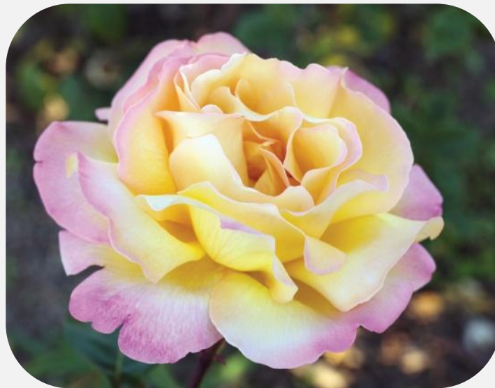
'Peace' [Meilland, 1935]