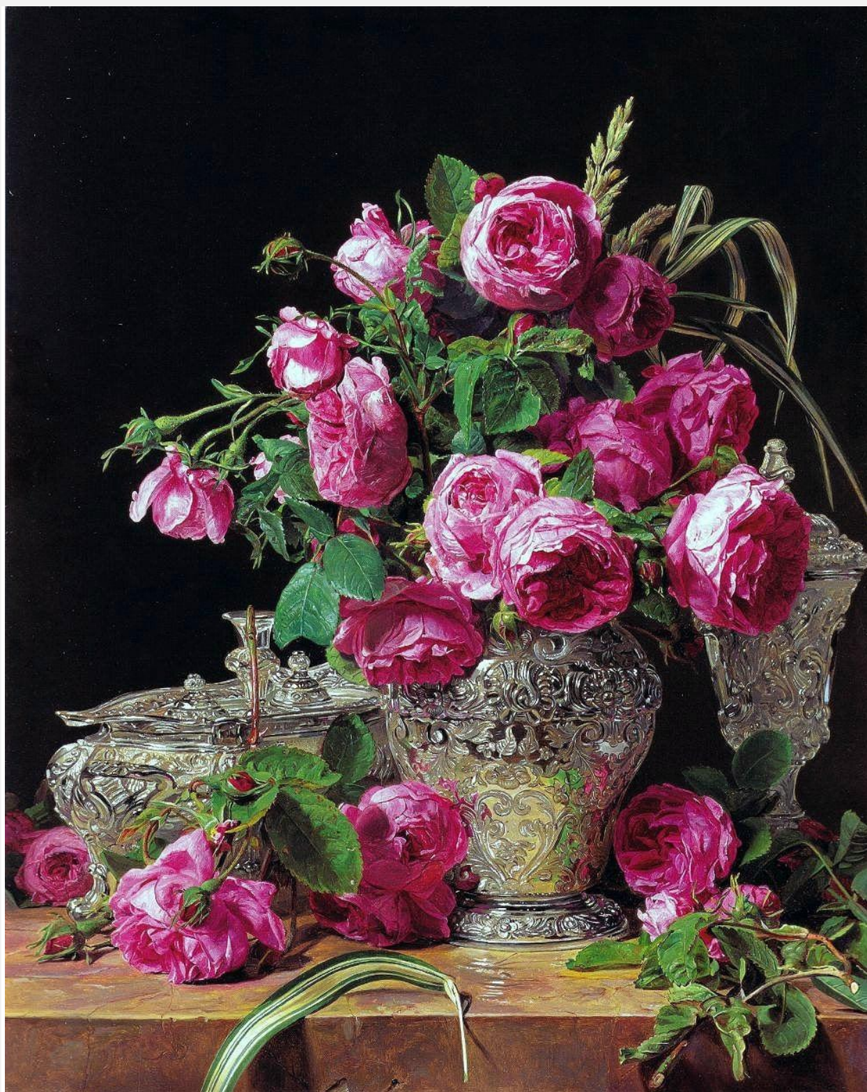
'Roses' by Ferdinand Georg Waldmüller (1793–1865)