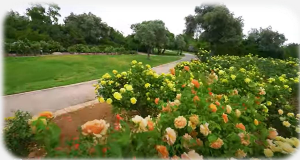
Wohl Rose Garden

This year the garden will be renovated and the rose collection renewed.