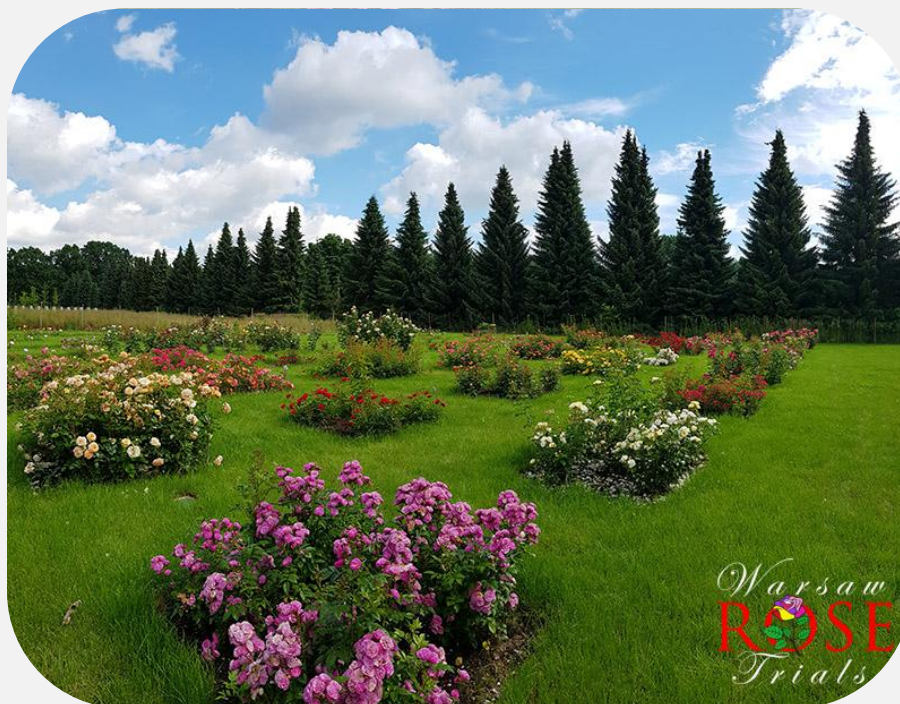
Warsaw Rose Trial Garden