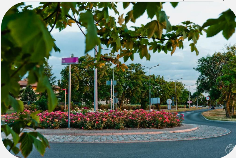
Kutno, City of Roses